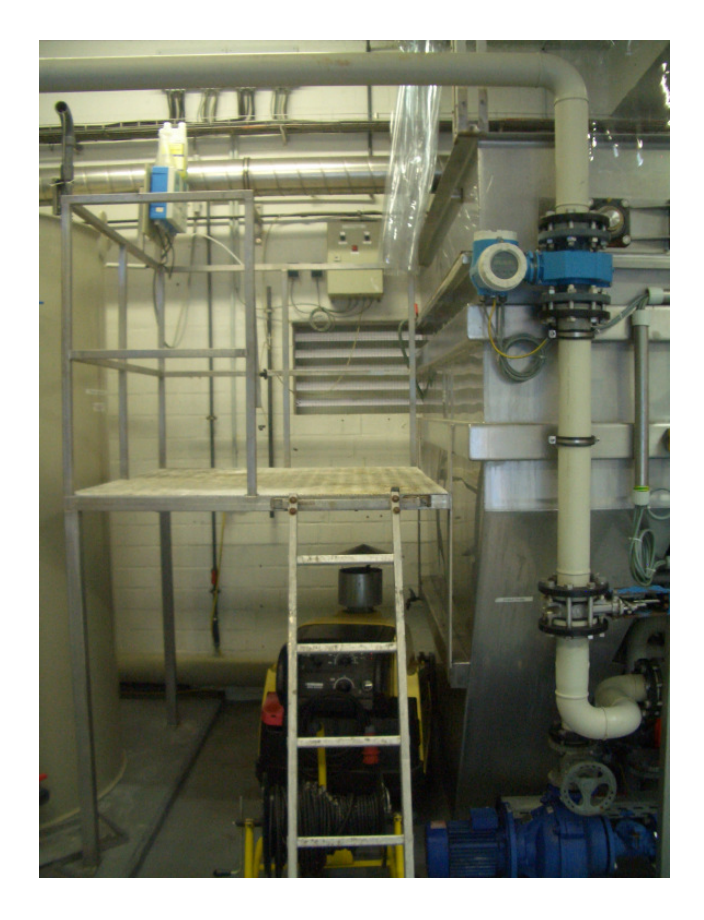
View into flotation tank (flotate, skimmer)