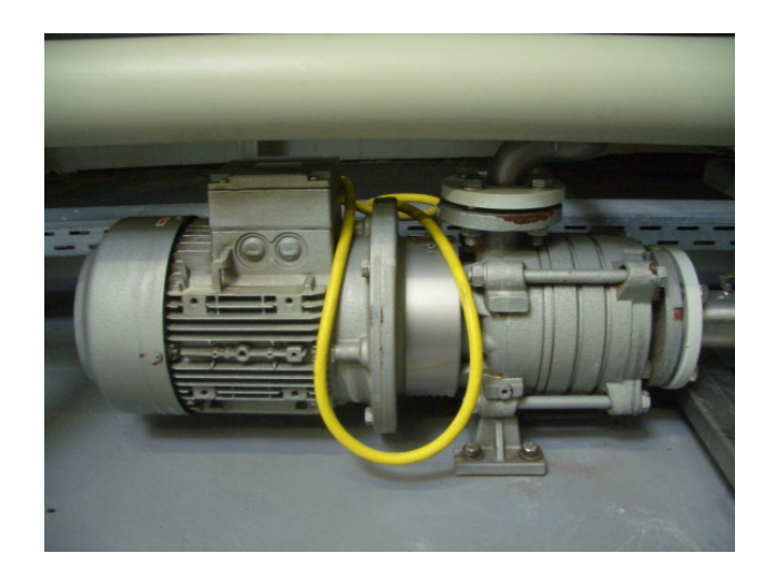
Air entrainment "above max. liquid level"