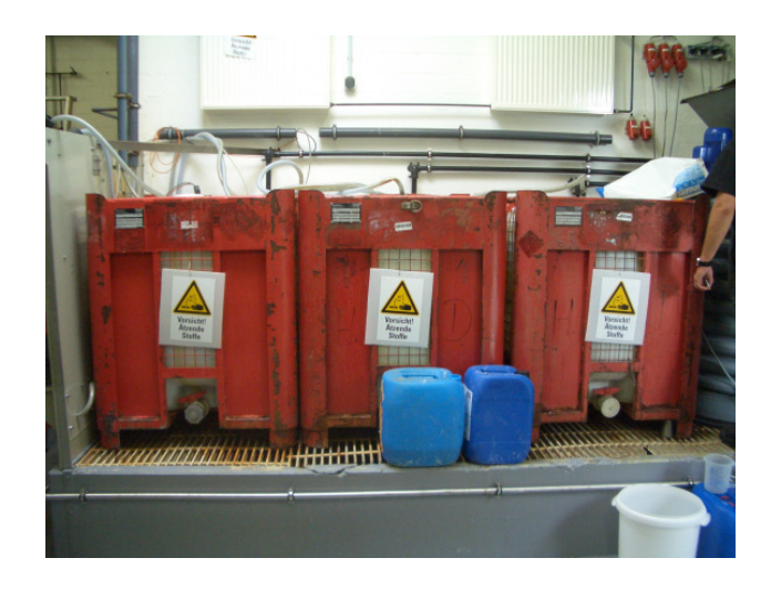
Dosing system (Prominent)